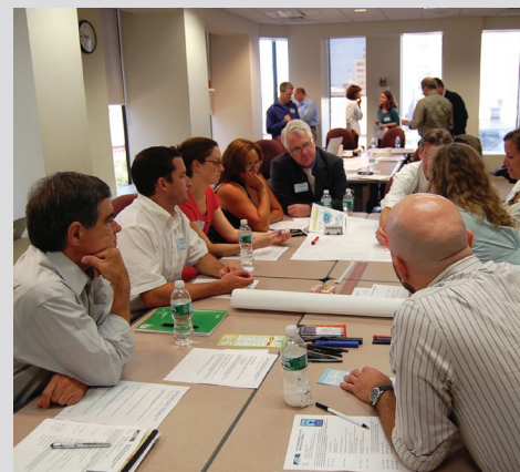
Above: participants in the Greater Kennedy Plaza planning workshop.